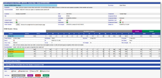
Pictured above: Sample details and history