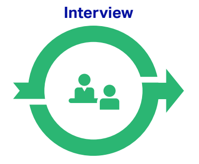
Applicants will get the opportunity to attend an Engagement Centre to experience group activities, gain exposure to the workshop and meet fellow Komatsu employees. You will be invited to a face-to-face interviews.